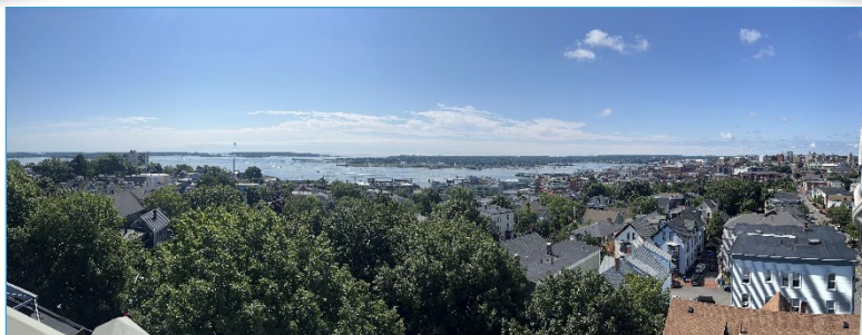
A summer view looking south from top of the Portland Observatory. The islands of Casco Bay are to the left; the Fore River is on the right.

*contact Co-Clerks for online Meeting for Worship links